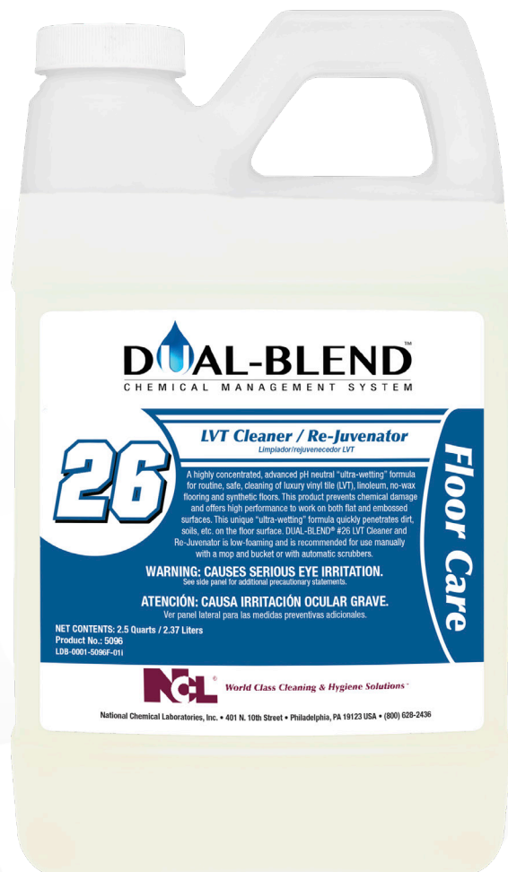
4 X 80 oz Bottles: Item #5096-24

401 N. 10th Street • Philadelphia, PA 19123 (800) NAT-CHEM • (215) 922-1200 • Fax (215) 922-5517 • www.nclonline.com